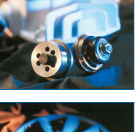
Large aluminum cooling fan and low compressor speeds keep the MTO II crankcase, cylinders and heads running cool, reducing wear and increasing the life of the unit.

Note: CCE10 pumps use steel reed valves.